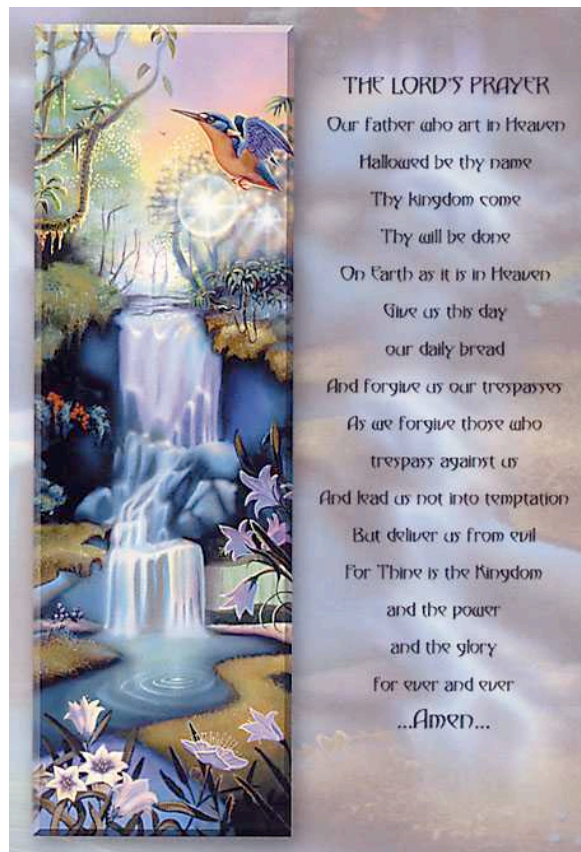
Biblical & other symbolism create a rich pool from which to draw inspiration for banners. Thank you to Koala Publishing, Ourimbah NSW for permission to use their card.