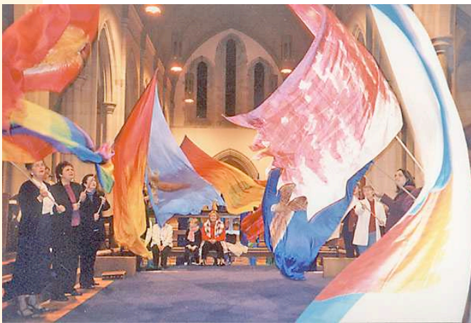
Celebrating David's 40th in the magnificent Church in central Toowoomba!

In June I celebrated my "Big 40" birthday with a worship time in Toowoomba Anglican Cathedral - It was great to have friends and family join to celebrate the milestone - many banner for the first time!