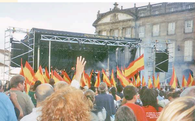
Fifty Spanish Young People declare God's faithfulness to Spain in Santiago in August. Another 60 worshippers then joined them with other banners in a celebration that went for over 2 hours!

I'll forward you a full report on the Spanish Prayer journey in the