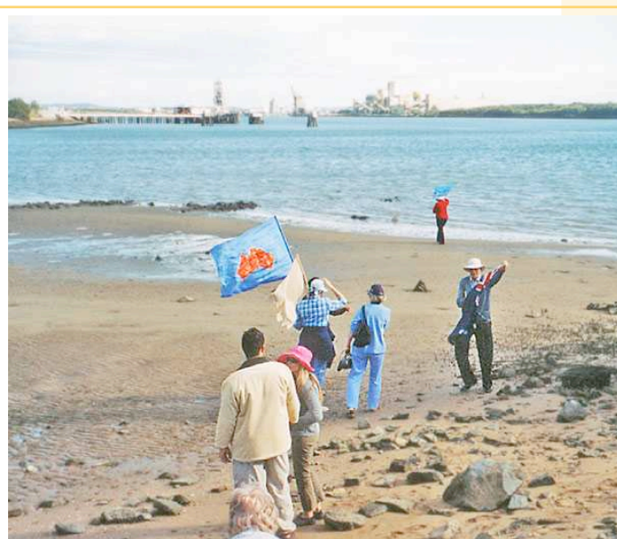
Out Of Our Minds Banner Design's "The Great Southlands of the Holy Spirit" and "The River" used as prophetic tools in digging a well of healing in Brisbane Australia.

At 2pm on June 29, 2003 a group of 21 of us met together at an appropriate site in obedience to God's word to us. We began with a time of worship then went into a prayer of repentance (adapted from Daniel 9) for the sins of our forefathers. We repeated De Quiros' proclamation over this "Southern Lands of the Holy Spirit" and made a Josiah declaration on behalf of Brisbane and the nation of Australia.