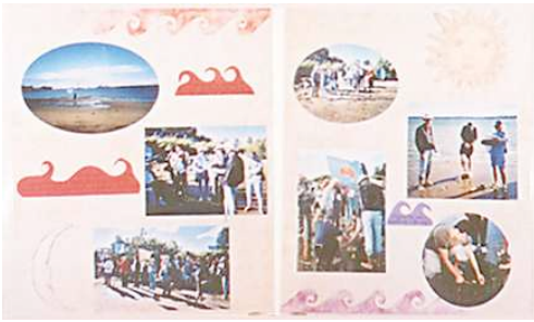
Recording the event in a scrapbook preserves the event for future generations.

Although they aren't mentioned in the letter, the photos show that several banners were used during the ceremony.