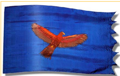
We have been so blessed by the eagle banner!