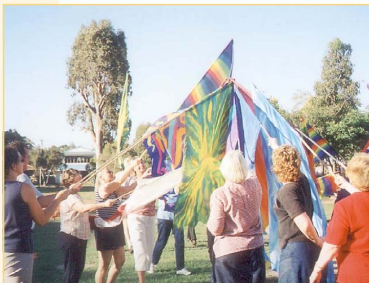
Working together in worship and warfare in the fresh air surrounded by creation can be a very powerful experience.