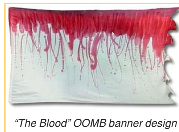
"The Blood" OOMB banner design

I walked around the garden for about 15-20 minutes praying the Blood of Jesus over the city and then I started declaring Jesus, the Cross and the Blood. Then Helen came racing over to tell me what she'd seen in the spirit as she had prayed. She didn't know what I had been praying but she had seen an angel with a massive Blood banner come down and start to circle the city in the direction I was walking, going around faster and faster and then she'd seen a huge cross rise over the city.