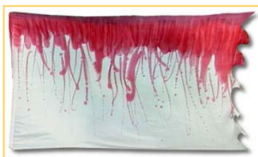
"The Blood" OOMB banner design

The first time I attended the prayer meetings for Tibet, under a "fit