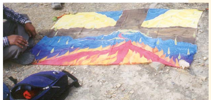
Tibetan Prayer Shawl face down on a barren Tibetan hillside