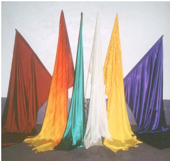
The Holy Spirit inspired several people at Christian Outreach Centre Narrabri to establish banners as part of the prayer and worship life of the church.

During this time, the Lord was raising up an intercessory team facilitator in COC Narrabri who shared the vision concerning banners and works closely with the prophet.