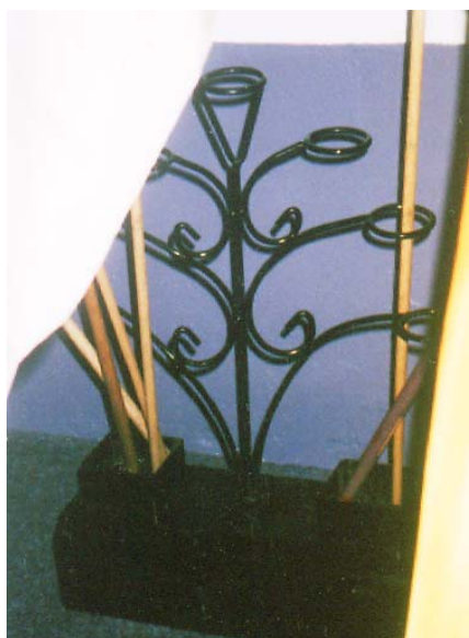
Close up of Narrabri COC banner stand.

For example, one man operates the Holy Fire flag with vigour yet when operating the Blood banner, his movements are smoother. Each operator stays in communication with the oversight and slowly the Lord is building an anointing into the people as revelation comes.